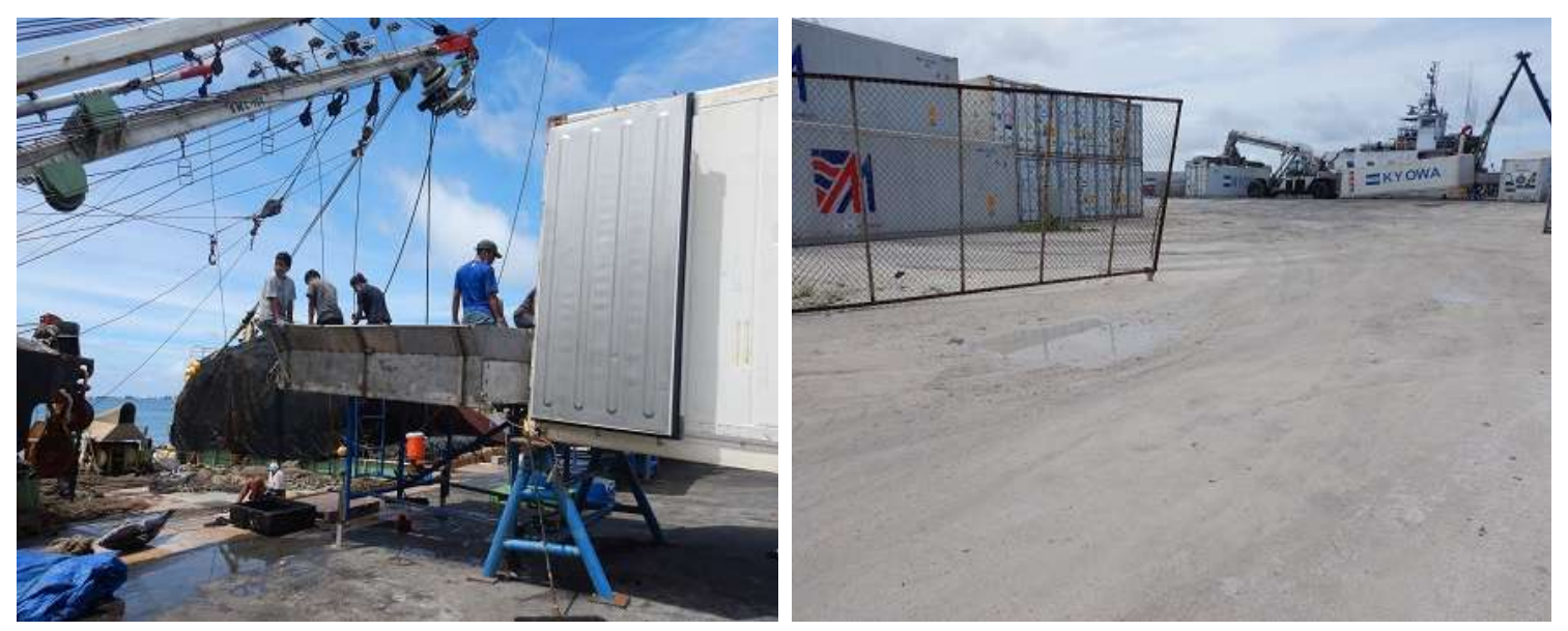
Fish unloading and containerization at the PII loading dock

A follow-up inspection was conducted at the PII landing site as part of the CA routine activity. Follow-up inspections are carried out to investigate whether previous non-conformances have been adequately addressed. These issues are addressed in the report properly and presented to PII for action.