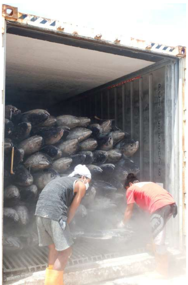
MIFV employees loading freezer containers of fish at Delap Dock

The CA team evaluated the loading and containerization operations for MIFV at Delap Dockyard.