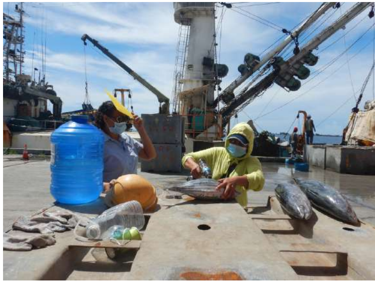
Taking the temperatures of the fish

An additional purpose of the random CA inspections is to monitor the state and condition of the surroundings and practices, including support transportation and storage, and observe fish temperatures to affirm the requirements of the RMI Standards and the operator's own documented procedures. These random inspections are carried out by the CA as part of its regulatory verification roles.