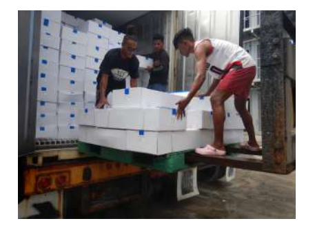
Imported tuna loins inspection by Oceanic, CA, and Customs officials