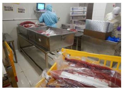
CO-treated tuna loins area destined for the US Market