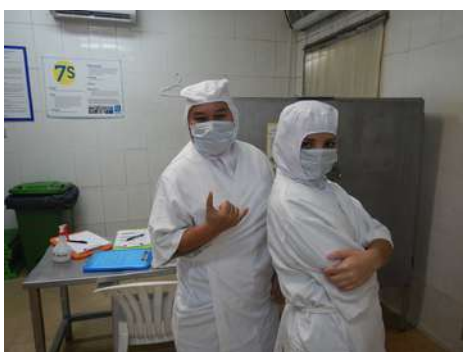
CA officers inspecting MIFV processing plant

MIFV has been receiving imports of frozen and CO-treated tuna loins from China as raw materials for their bandsaw products for further processing to be exported to their buyers. This was done to fulfill MIFV's order request and meet quotas. The CA inspected these containers to verify the information sent in from China. MIFV also sent in testing results from China and the CA verified these results are correct by comparing them to testing results done at the MIFV and PPF laboratories.