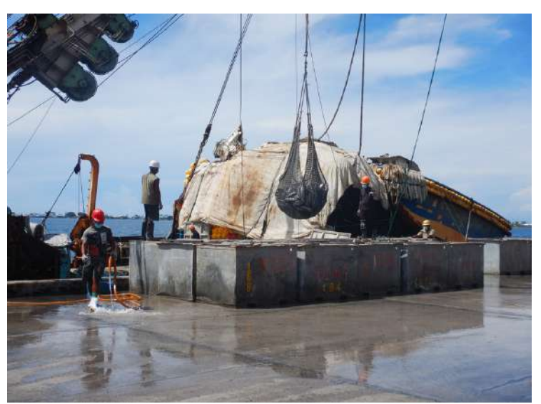
Site inspection at Delap dockyard