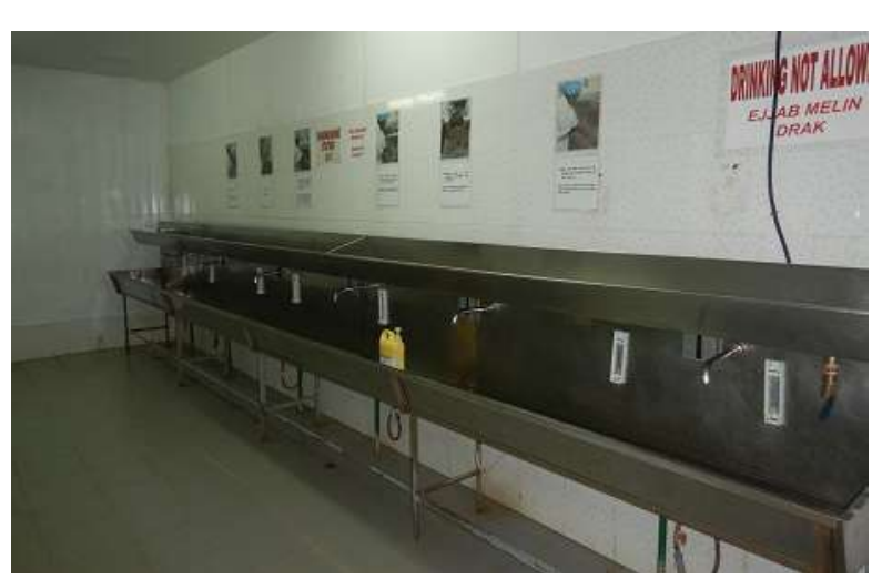
Hand washing stations in PPF processing facility