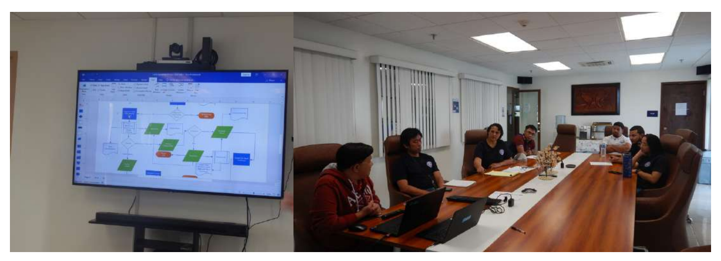
PPF team presenting to MIMRA CA and IT on their traceability system at MIMRA conference room