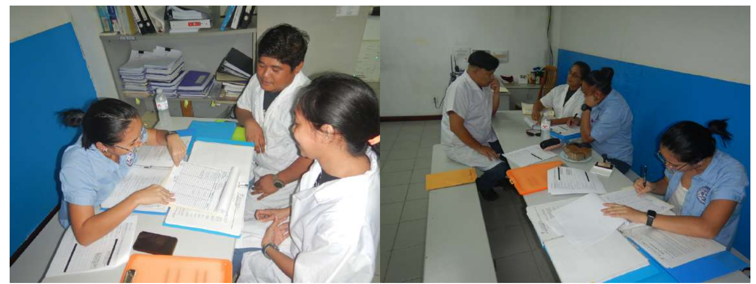
CA officers evaluate fish origin and documents to confirm legality and other sanitary records at PPF

Among the many aspects of the CA inspections is a documentary assessment of a company's traceability system. This allows the officer to have a birds' eye view of the system the company has to ensure the fish sourced is from a vessel that follows management and conservation measures for the country it has authority to fish in, whilst at the same time has all the controls necessary to ensure safe fish production. Traceability assessment is part of the CA regulatory functions and must be built into its schedules and inspection plans.